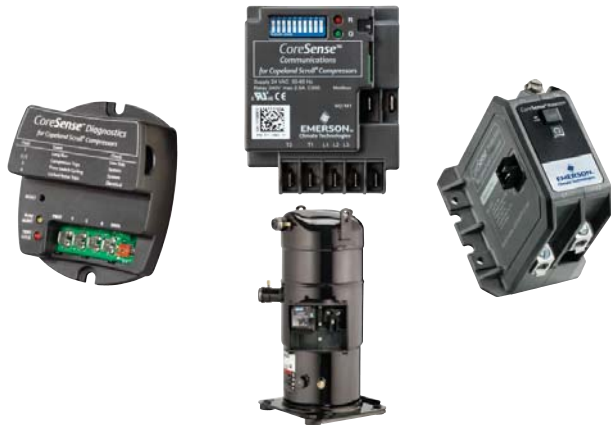
CoreSense Diagnostics for Copeland Scroll