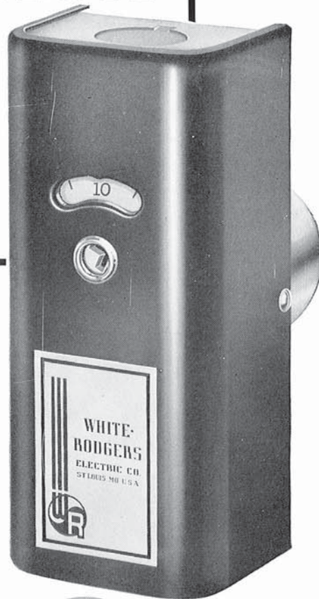
Type 1531 Low Side Pressure Control

"Hydraulic-Action" controls are also available through Julien P. Friez & Sons, Baltimore, Md., Division of Bendix Aviation Corporation, for 63 years the Makers of America's Weather Instruments.